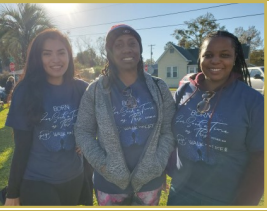
Some of our wonderful friends from All Nations Church.