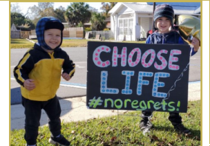
Raising a generation of children who LOVE LIFE!